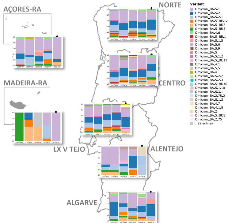
Figure 2: Evolution of the weekly relative frequency of SARS-CoV-2 lineages in each Health Region, between ISO weeks 34 (22/08/22 - 28/08/22) and 38 (19/09/22 - 25/09/22). Regional relative frequencies must be interpreted with caution due to the low number of samples in some of the regions. It is expected that the frequencies presented for the last week under analysis (ISO week 38*) might change in the next report, given that some data from that period is still being processed. These and other graphs can be explored interactively on the website.